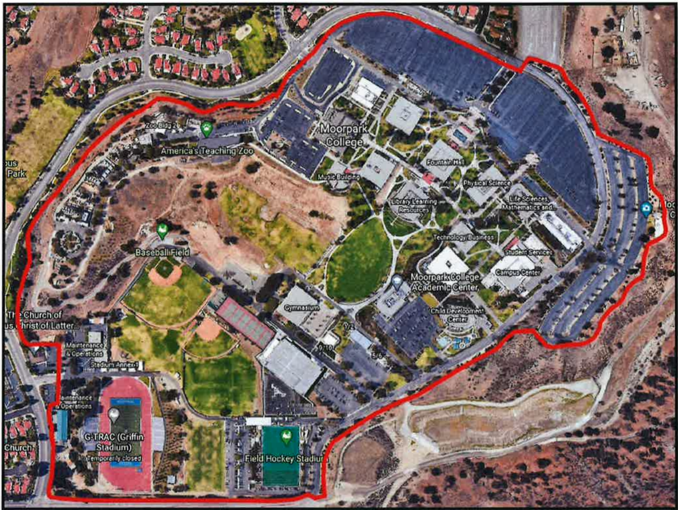
Appendix A. Satellite Imagery of Moorpark College with geographic boundaries superimposed.