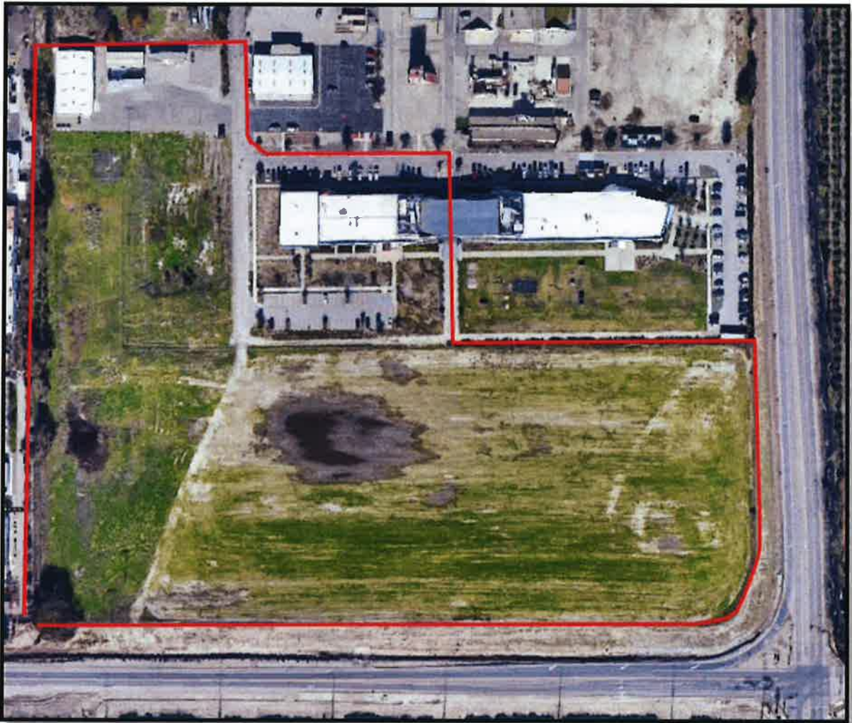
Appendix B. Satellite Imagery of the Oxnard College Fire Technology Academy with geographic boundaries superimposed.