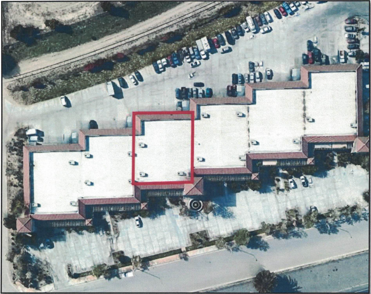
Appendix A. Satellite Imagery of Ventura College East Campus with geographic boundaries superimposed.