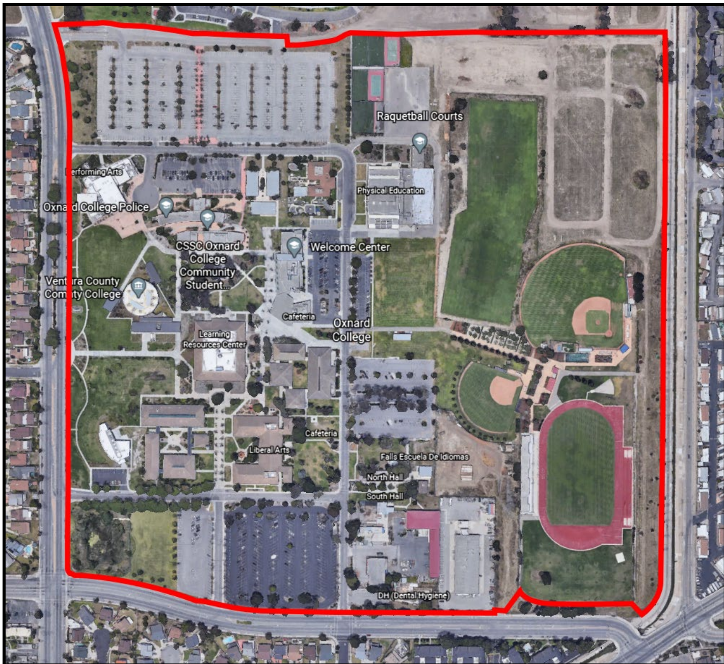
Appendix A. Satellite Imagery of Oxnard College with geographic boundaries superimposed.