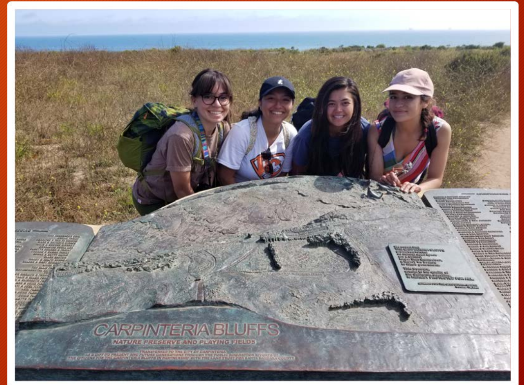
EOSO 19-20 Executive Team