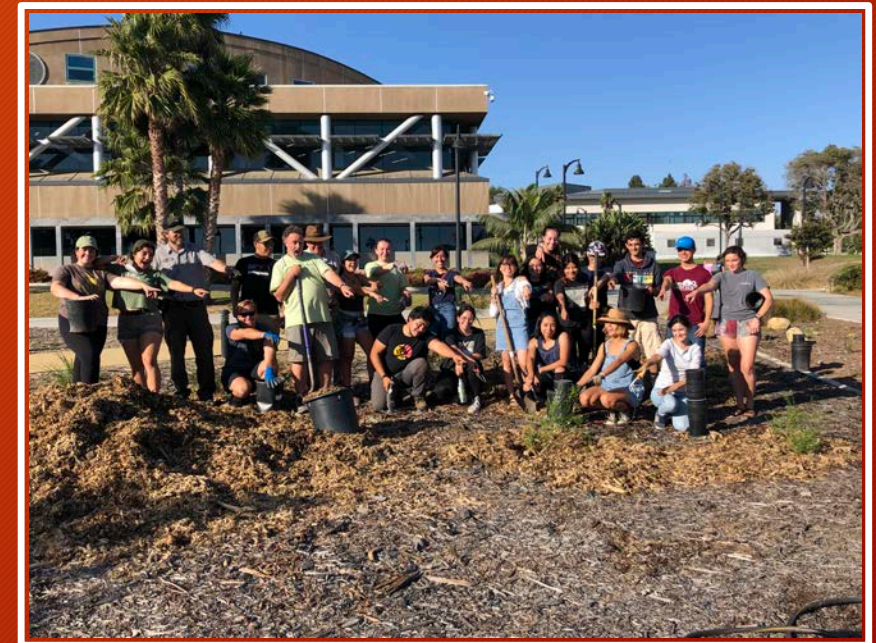
VC's "Global Garden"