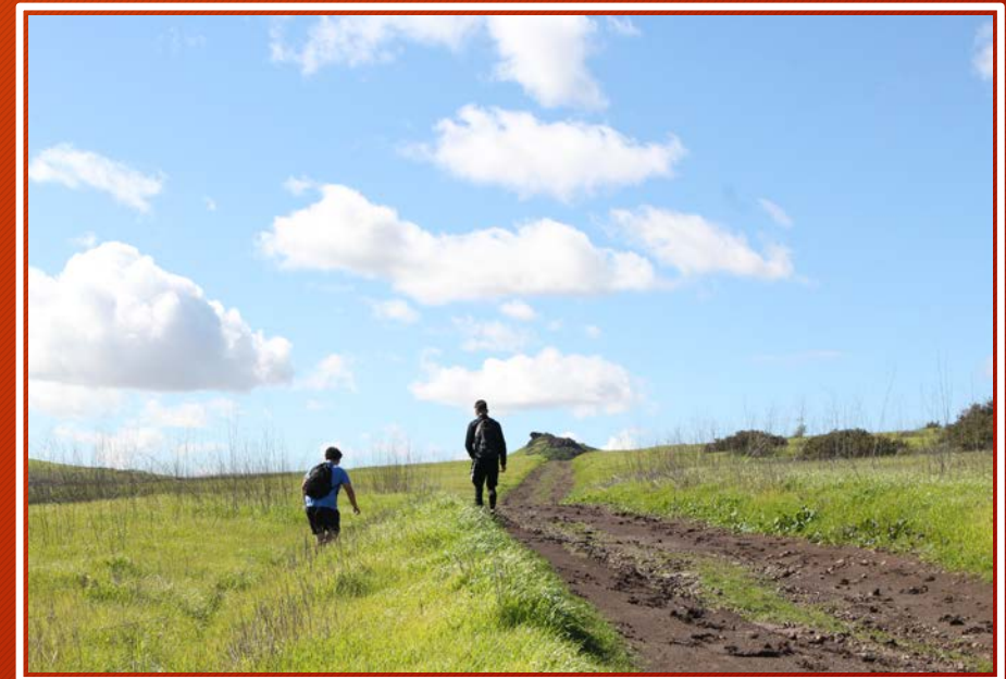
EOSO in Ventura Open Space