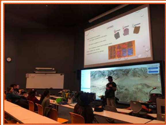
Outdoor Gear Workshop