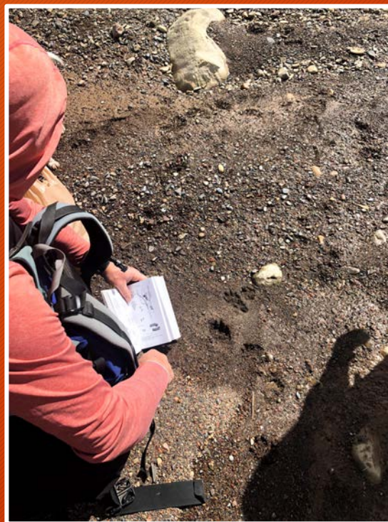
Ventura River Preserve