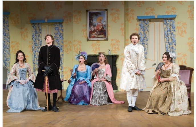
Les Femmes Savantes MPC 2011