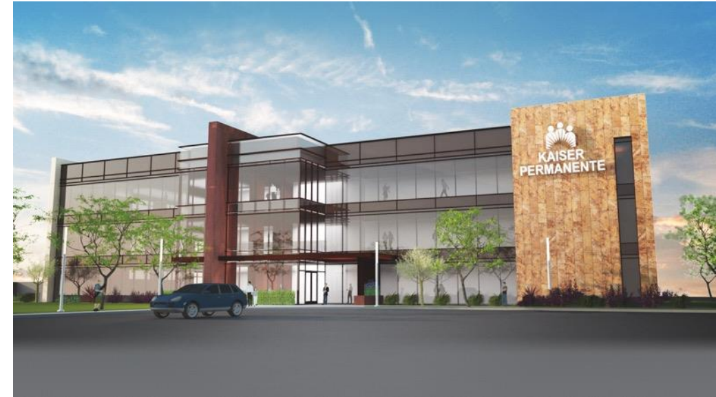
Porter Ranch Medical Offices (rendering)