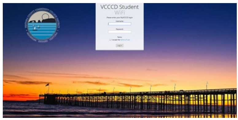
Figure 1-VCCCD Student Wifi Page

(Applications on smart phones will not connect unless users go to a browser first and login)