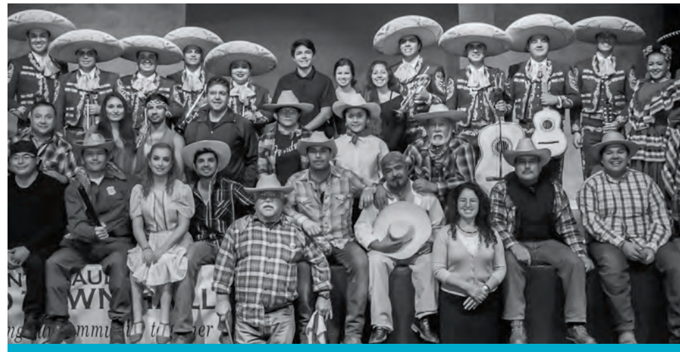
The cast of El Bracero - Mariachi Opera. The Mariachi music in El Bracero is performed by Mariachi Aguilas de Oxnard.