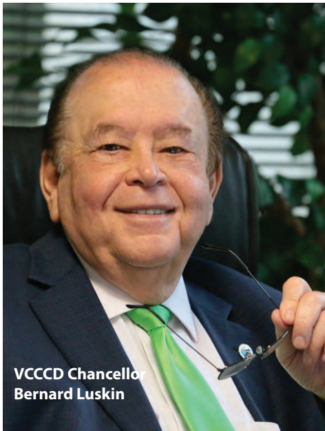
VCCCD Chancellor Bernard Luskin

This issue is dedicated to celebrating Black History Month (February) and Women's History Month (March) by acknowledging the impact that African Americans and women have had on the growth and success of community colleges nationwide and specifically in the Ventura County Community College District. In particular, we acknowledge the men and women who, with our students in mind, have mobilized the movement to make college more affordable. In 2006, Ventura College led the charge to start the first College Promise in the State of California. Since the inception of the Ventura College Promise, 22 College Promise programs have been established in California (13 of which were recently announced). Throughout the nation there are now more than 150 College Promise programs across 37 states. 1