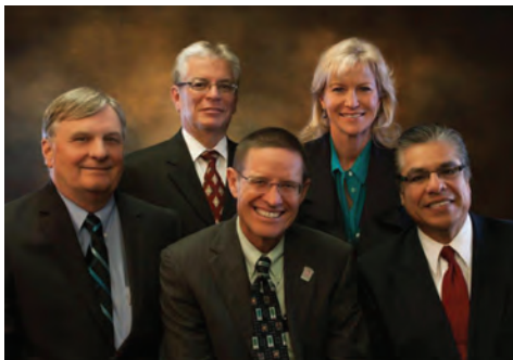
VCCCD Board of Trustees