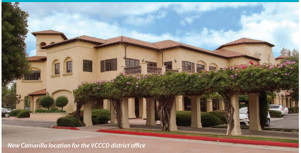
New Camarillo location for the VCCCD district office

The Ventura County Community College District administrative center is relocating to Camarillo. The move is scheduled for Friday, April 21 through Sunday, April 23, 2017. The new address is 761 East Daily Drive, Camarillo, CA. Phone numbers for the DAC and all employees will remain the same. The building is 38,893 square feet of office space situated on a 20-acre professional office zoned and master-planned seven building site. The new site is centrally located and provides improved accessibility for students, faculty, staff and community members within the VCCCD service areas.