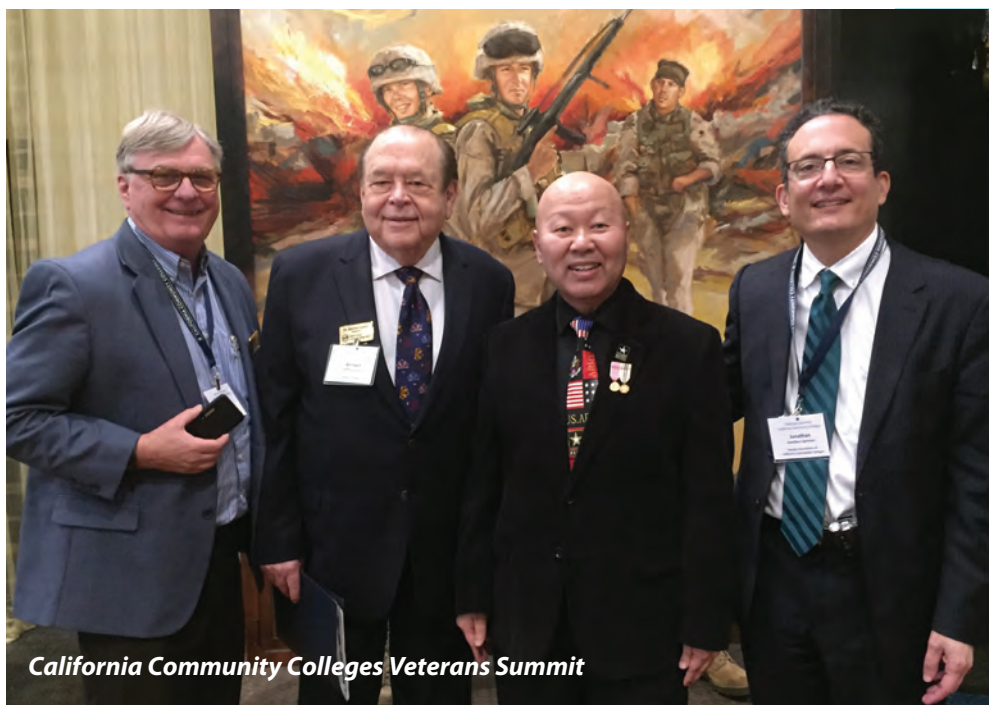
California Community Colleges Veterans Summit