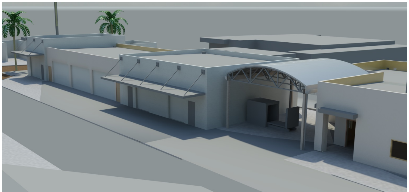
Maintenance and Operations Renovation, Architect Rendering

Current projects at Ventura College include the new Applied Science building and Renovation of the Maintenance and Operations Building. Construction on the renovation of Building H (Fine Arts) project is scheduled to begin next year.