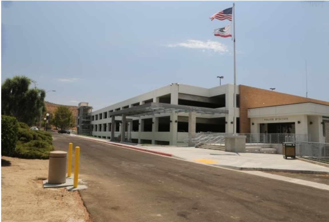
Parking Structure, Police Station