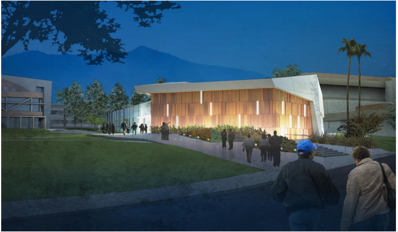
Applied Science Center, Architect Rendering