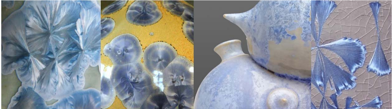
All images are of cone 10 crystalline