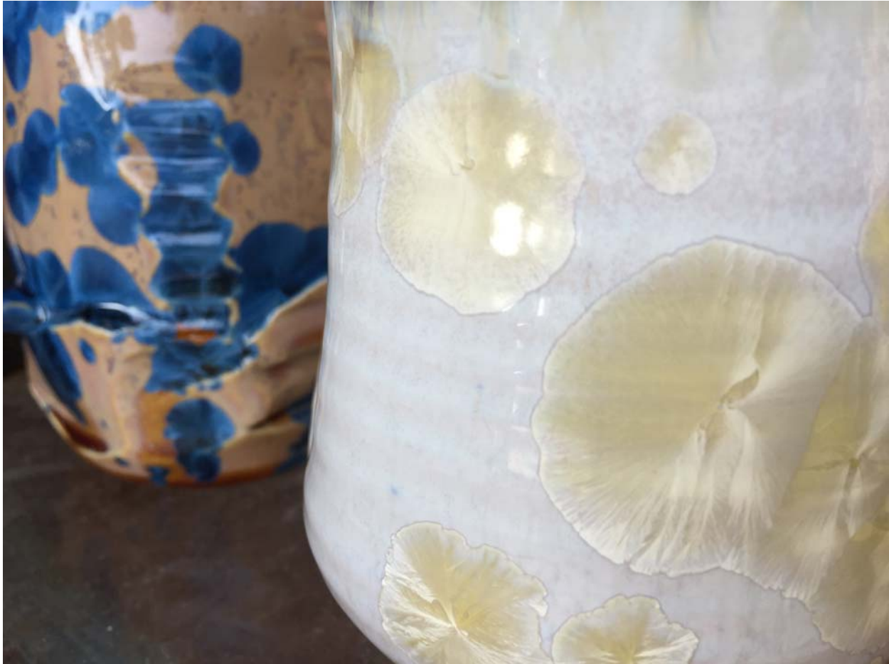
Image of cone 10 crystals