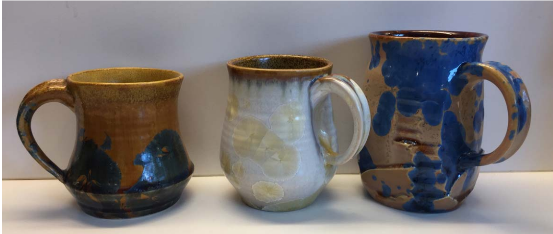
All pieces are cone 10 crystalline