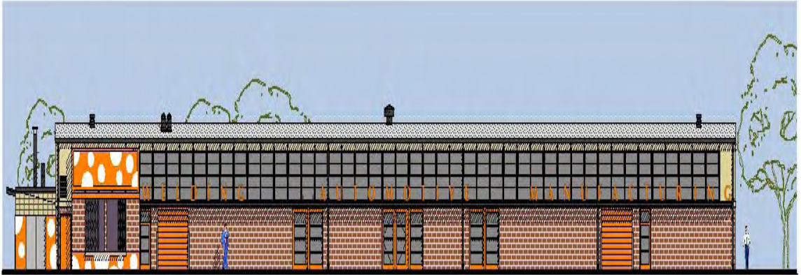
BUILDING S WEST ELEVATION