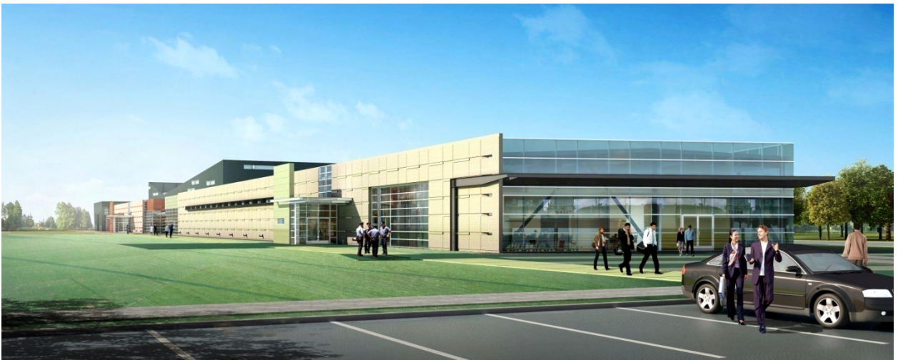
Regional Fire/Sheriff & Police Education and Training Academy - West Elevation