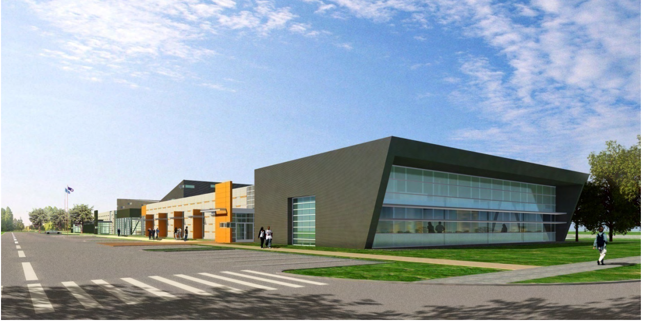
Regional Fire/Sheriff & Police Education and Training Academy - South Elevation