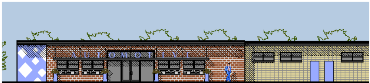
BLDG APP SOUTH ELEVATION