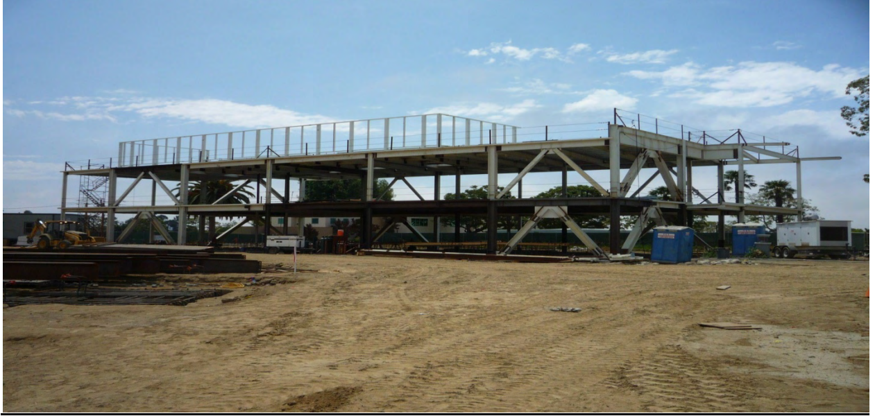
Health Sciences Center (as of 5-19-09)