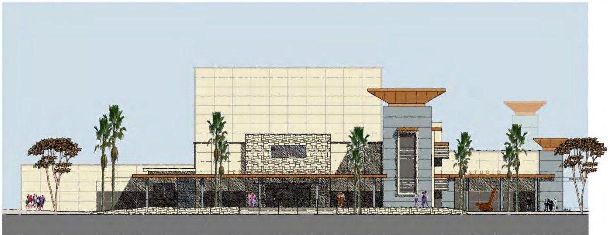
Theater (G Building) – North Elevation