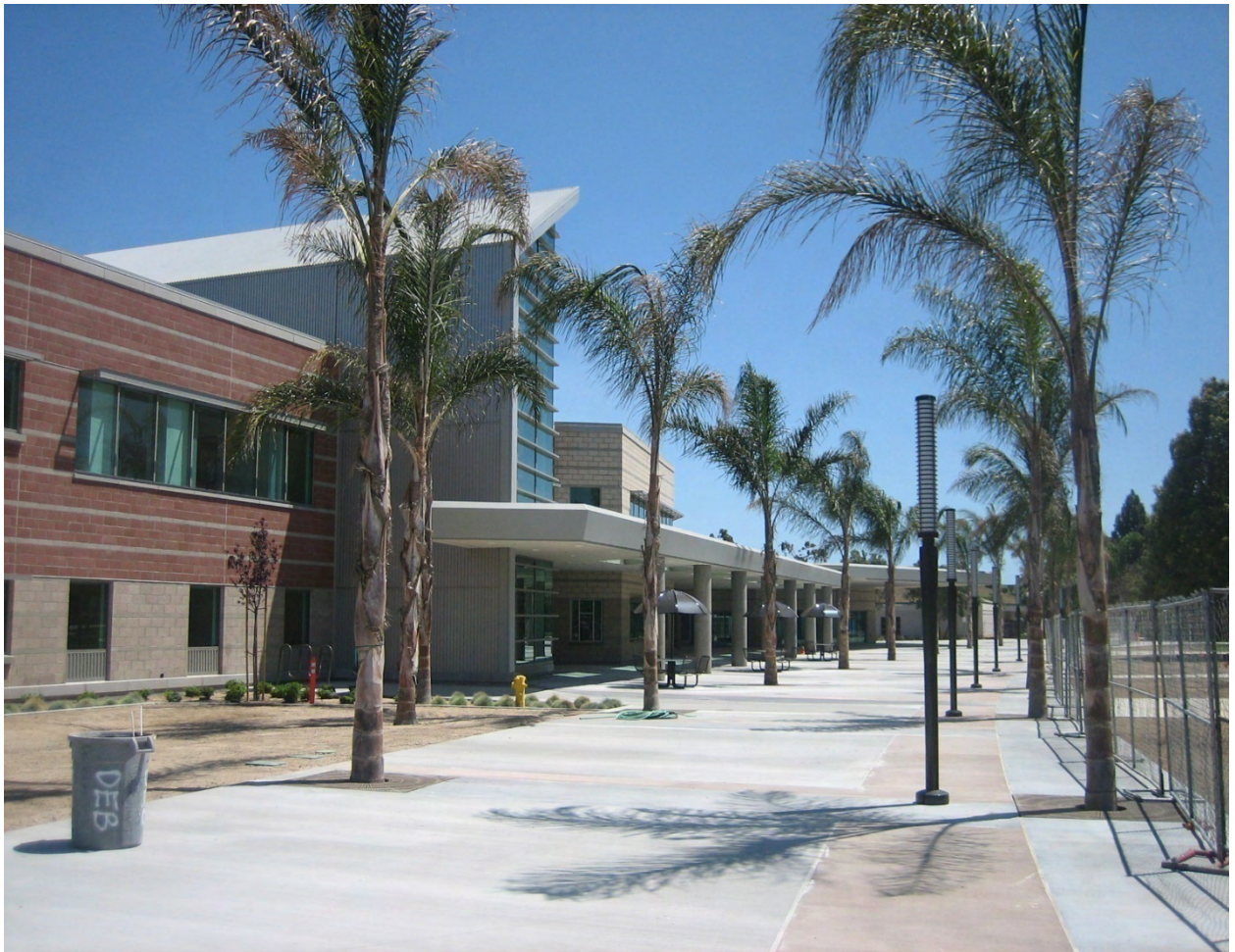
Oxnard College Student Services Center West Elevation

This project consists of the Admission and Records office and a new Cafeteria. The Student Services Center will consolidate student administrative services into a one-stop center, including Admissions, Assessment, Business Office, Campus Administration, Disabled Students, Matriculation, Student Health, and Transfer Center. The cafeteria is an attached structure with interior and exterior dining areas, with capacity for 150 to 300 people. The Student Services Center is a two story structure with a gross area of approximately 38,000 S.F., and has achieved a construction progress of 99% complete to date. Furniture deliveries will start in mid June and this activity is expected to be completed by mid July 2009.