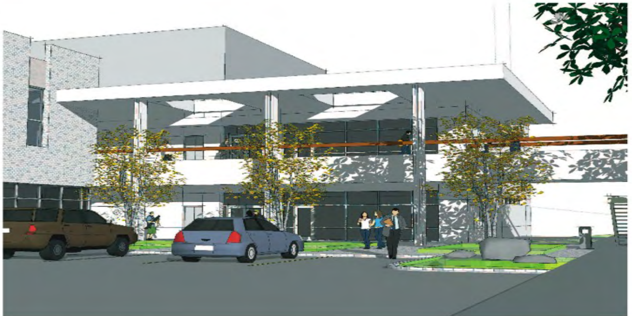
Moorpark College Academic Center

HVAC equipment is stored on site and will be set in place after placement of roof curbs currently in fabrication.