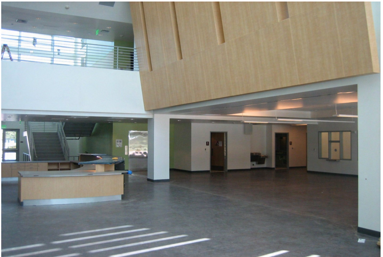
Oxnard College, Student Services Center, Lobby