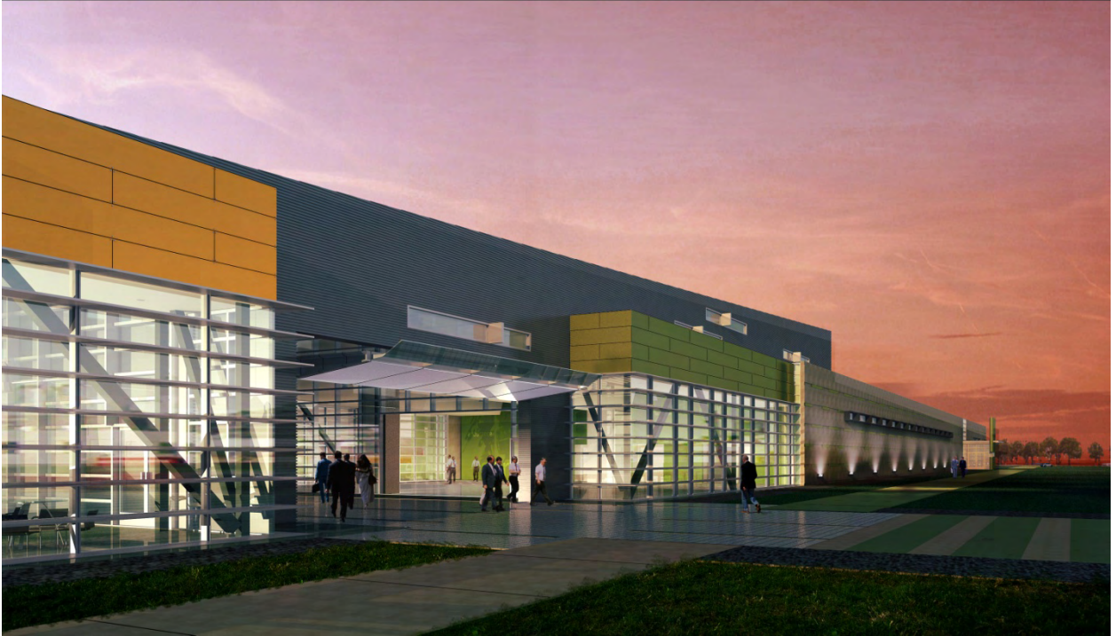
Regional Fire/Sheriff & Police Education and Training Academy – North Elevation