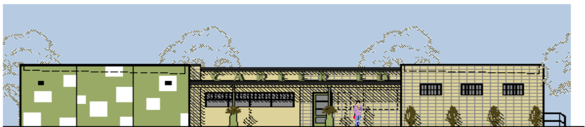
BLDG DP EAST ELEVATION