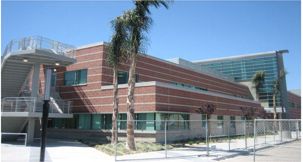
Oxnard College, Student Services Center East Elevation