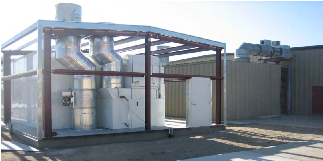
Auto Tech: Inside the New Metal Building's Structure

This project is scheduled for completion mid-June 2009.